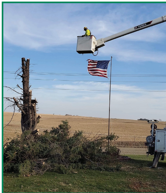
Franklin REC's line crew works on tree trimming.

If you notice that your trees are growing into power lines, contact Franklin REC to determine the next recommended step.