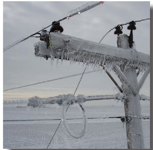
Ice that accumulates on lines and strong, high winds can impact distribution.

Please contact us with questions about outages or to learn more about the steps we take to provide reliable service. For more information about electrical safety, visit SafeElectricity.org .