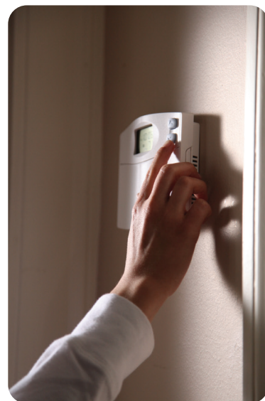
Turn thermostats down in the winter and up in the summer. Dress in layers to stay warm or use fans to stay cool.