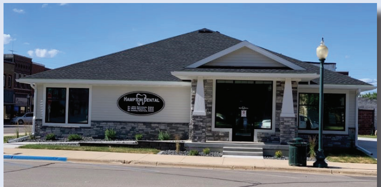
The new Hampton Dental office.

Franklin REC is honored to help local business owners realize their dreams and to help keep services local for our members. If you are interested in our USDA loan program, please contact us at 641-456-2557.