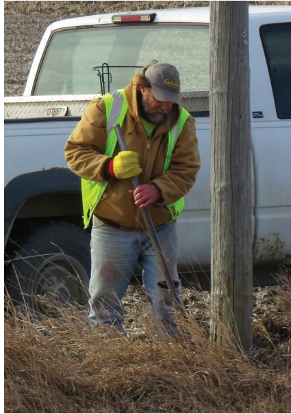
One of our contract workers preparing to drill a pole to check how solid it is.

As we head into cooler weather, you can rest assured that we are performing the maintenance needed to continue providing you with the service you deserve.