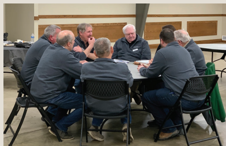
Following the annual meeting, the board held their reorganization meeting.