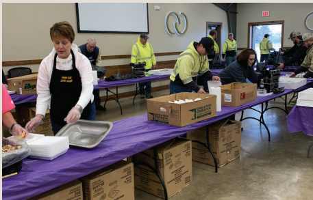
Franklin REC employees, directors, and the Franklin County Development Association director assemble meals during the drive-thru event.